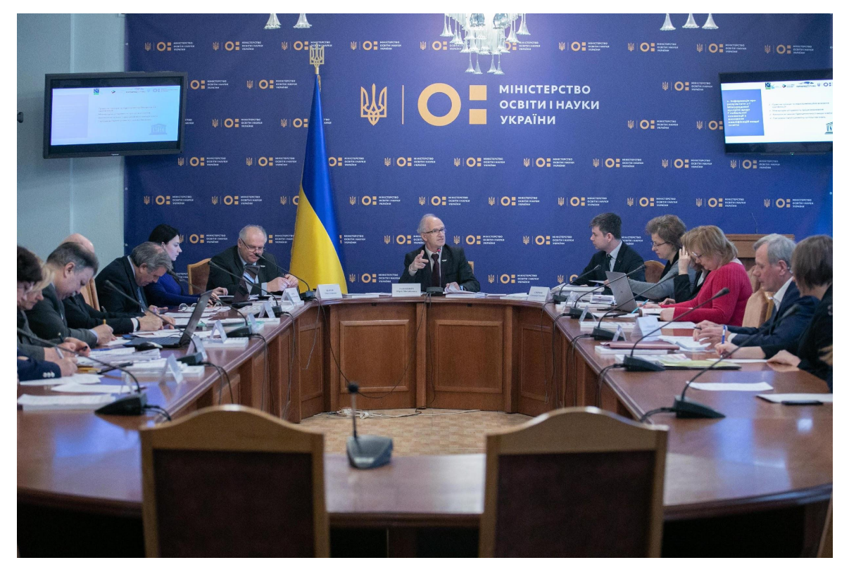
Meeting of the National Bologna Follow-Up Group (March, 2019)