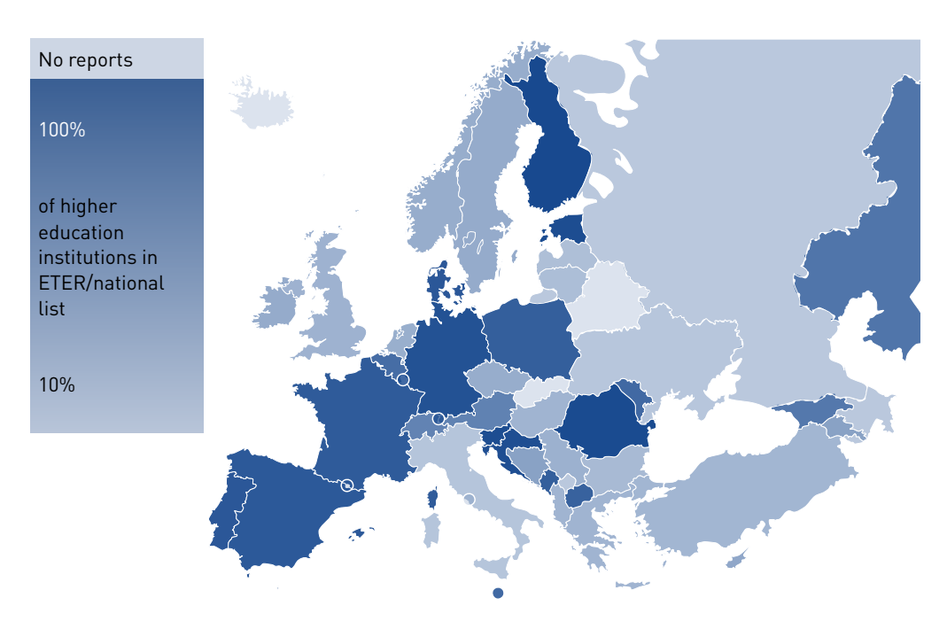
Figure 1: DEQAR coverage measured as the share of HEIs with QA reports

Further general information on DEQAR can be found at: