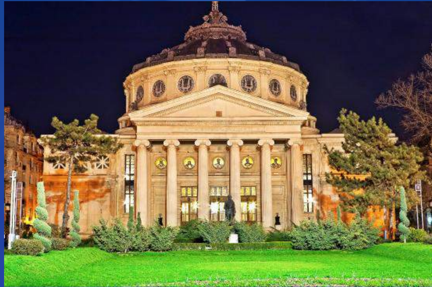
The Romanian Athenaeum