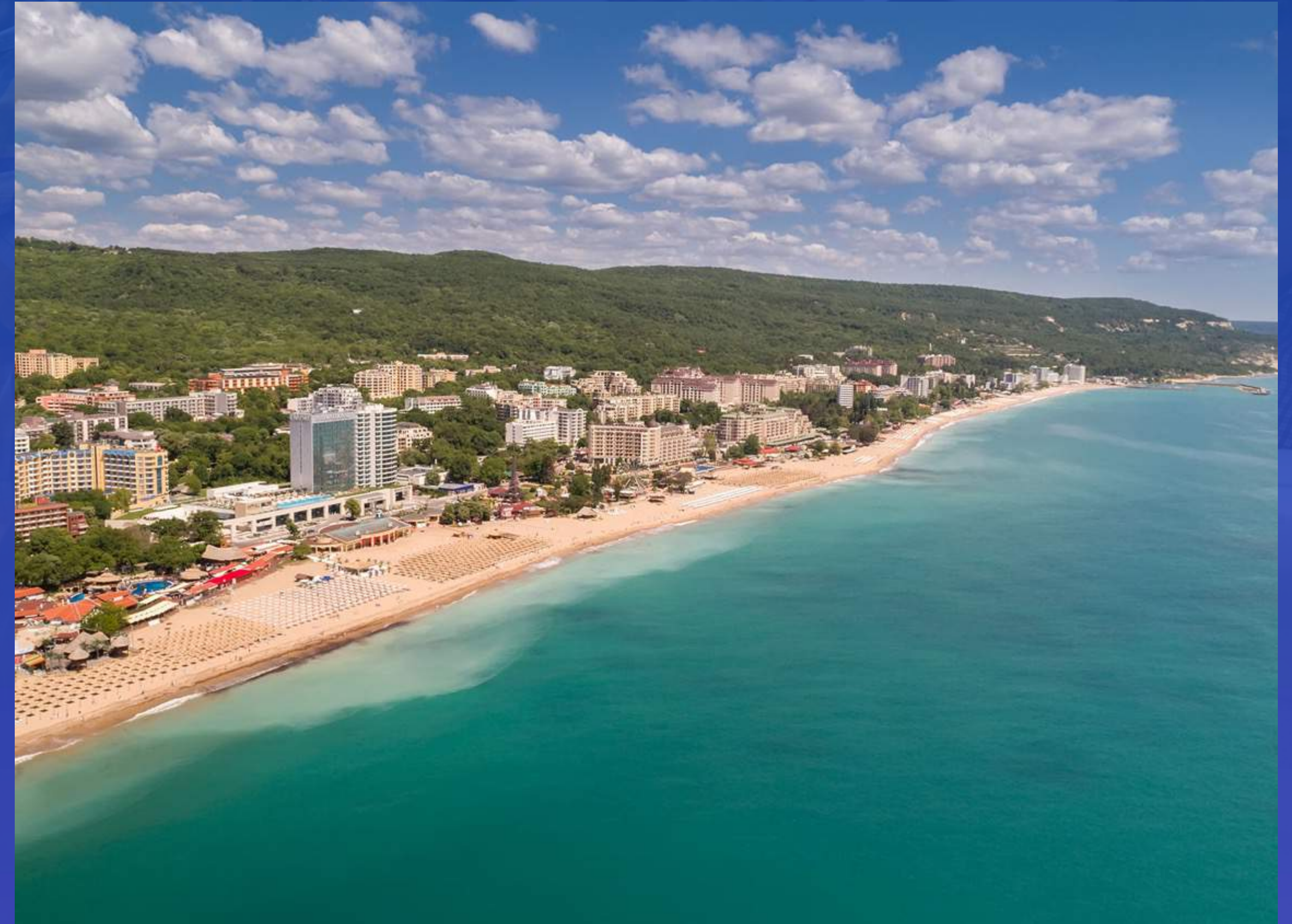
The Black Sea