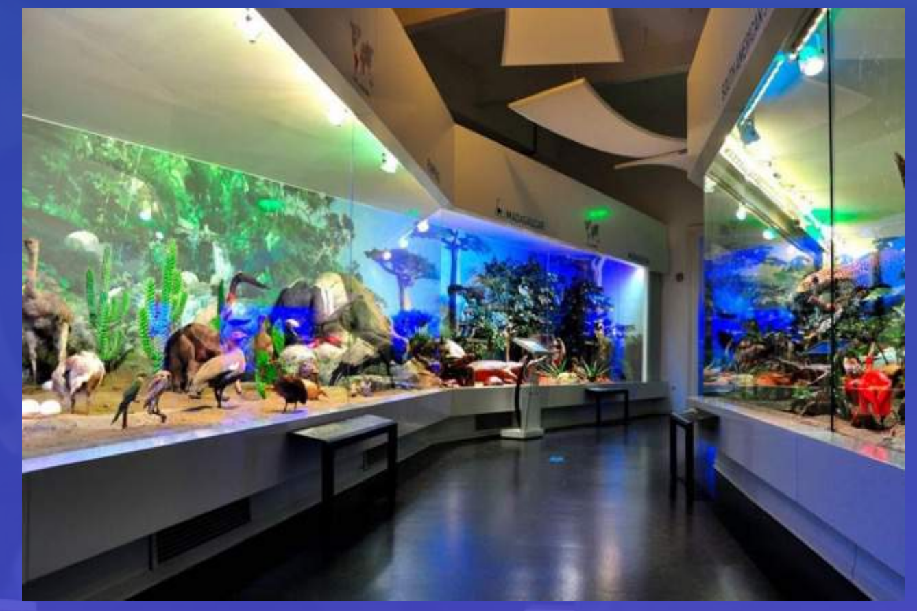
Museum of Natural History