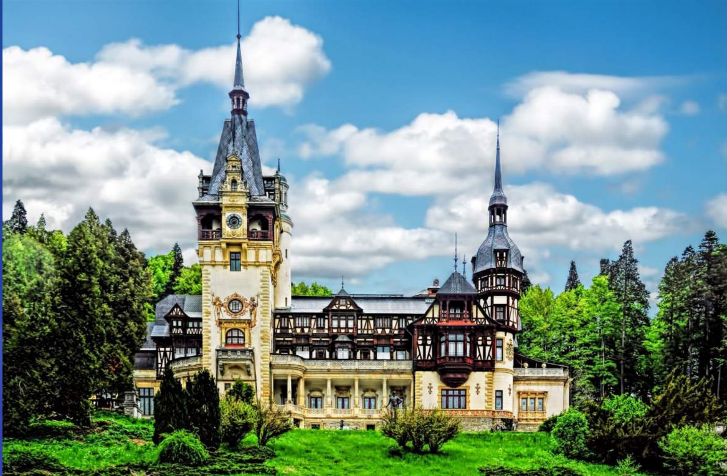
The Peleş Castle (the first European castle entirely lit by electrical current)