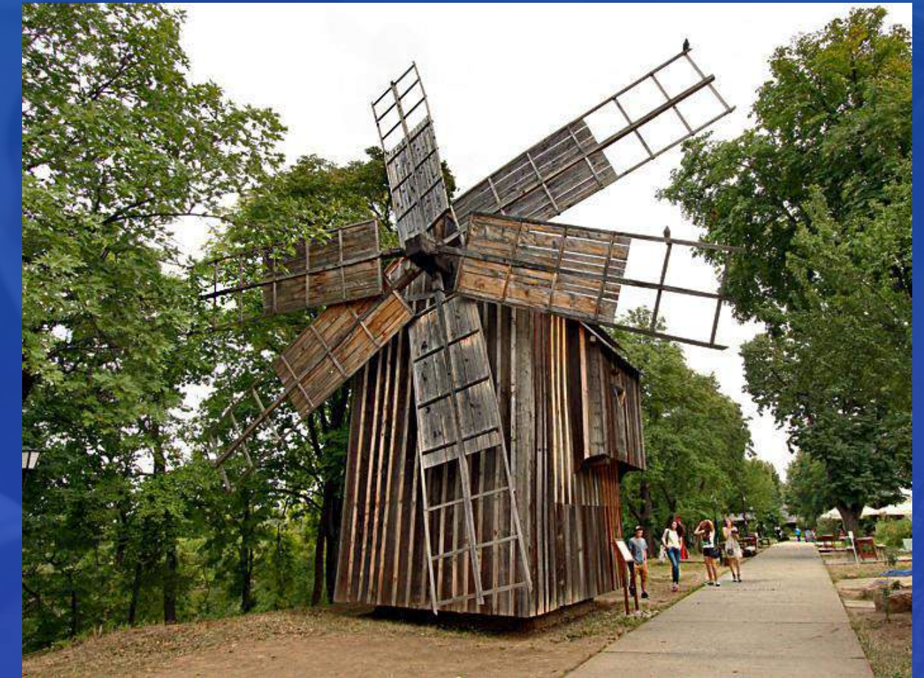
The Village Museum