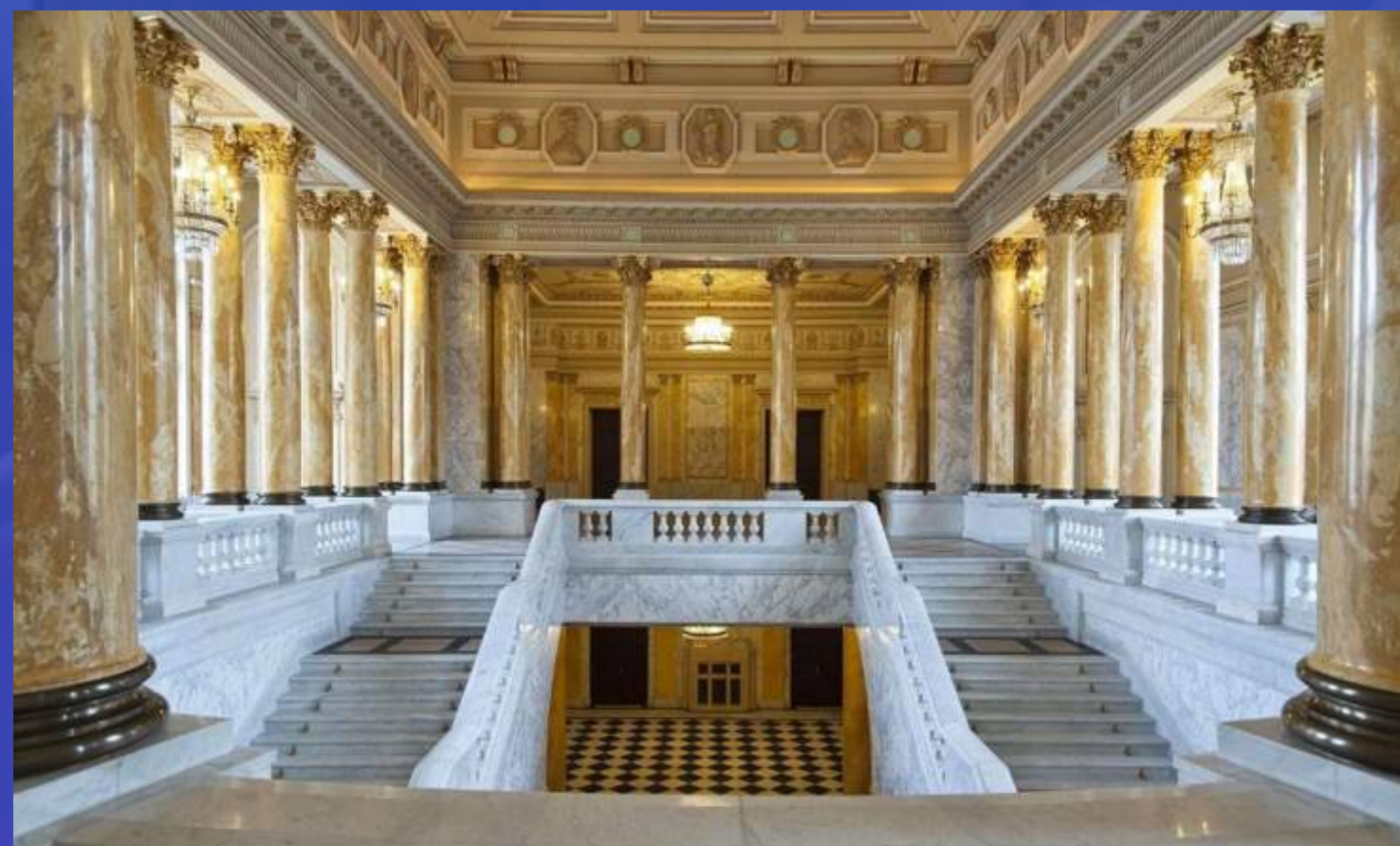
National Museum of Art