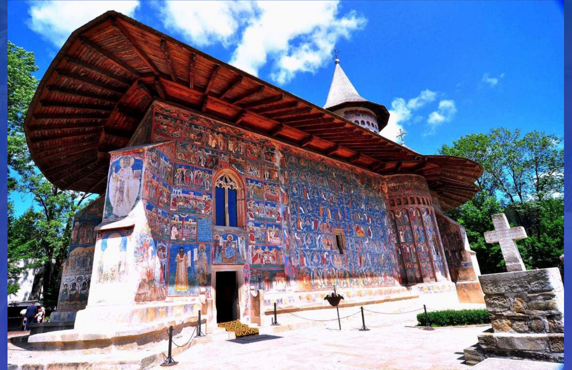
The Voronet monastery (UNESCO site)