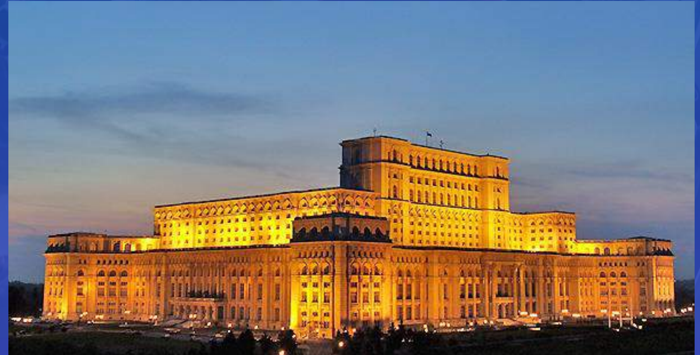
The Palace of Parliament