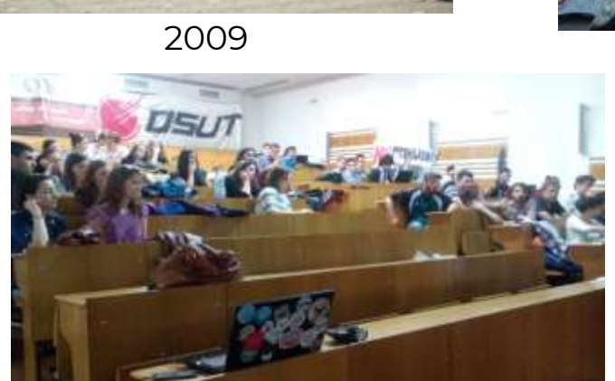
Occupy your university (2015)