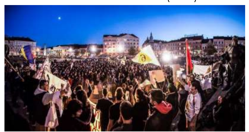
6% for education (2013)