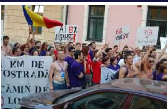
SANE VADA TINEM ORELE IN STRADA PIR