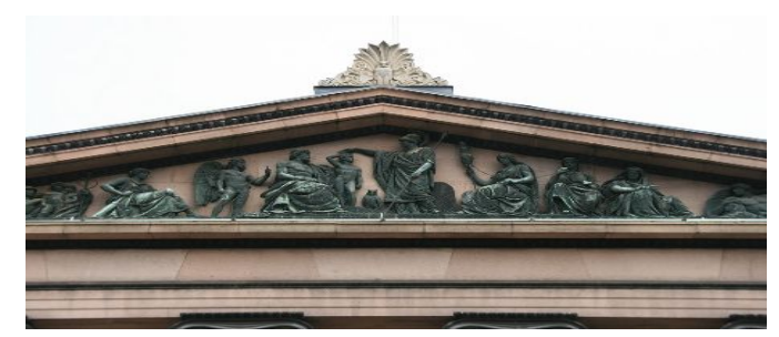
University of Oslo, frieze, Domus Media