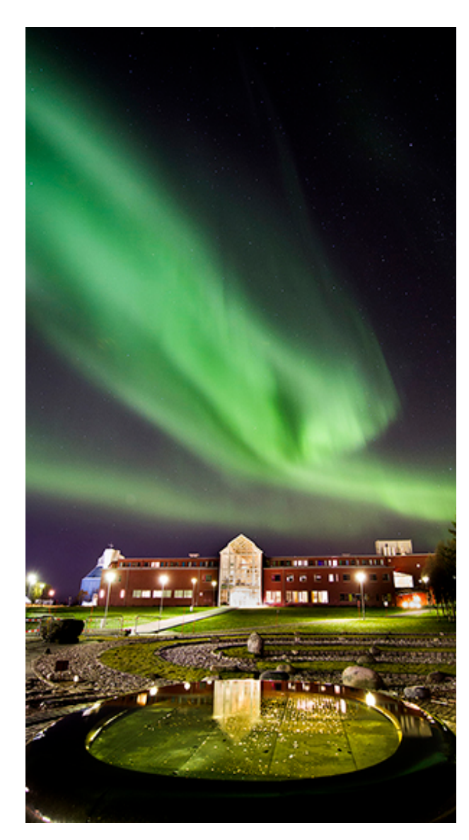
University of Tromsø and Aurora Borealis